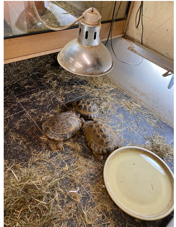
Some of the Lawton tortoises huddling under their heat lamp 4/3/20

Life is beginning to stir as our wildlife emerges from a winter in hibernation. Likewise, if you own tortoises that have hibernated this year it is time to check on them. With the mild winter weather last year some owners found it hard to encourage their tortoises to go into hibernation, others found that they woke early. If tortoises were not cold enough during hibernation, they may have used up precious reserves and may need help to recover. Remember warm baths are useful to rehydrate and bring your tortoise's internal temperature up to their preferred range. If the weather turns cold as it so often does in March keep them warm at all times. Tortoises should be eating within a couple of days. We offer a post hibernation health check for all your tortoises at a special discounted rate. If you have any concerns for the health of your tortoise please telephone us for advice from our vets.